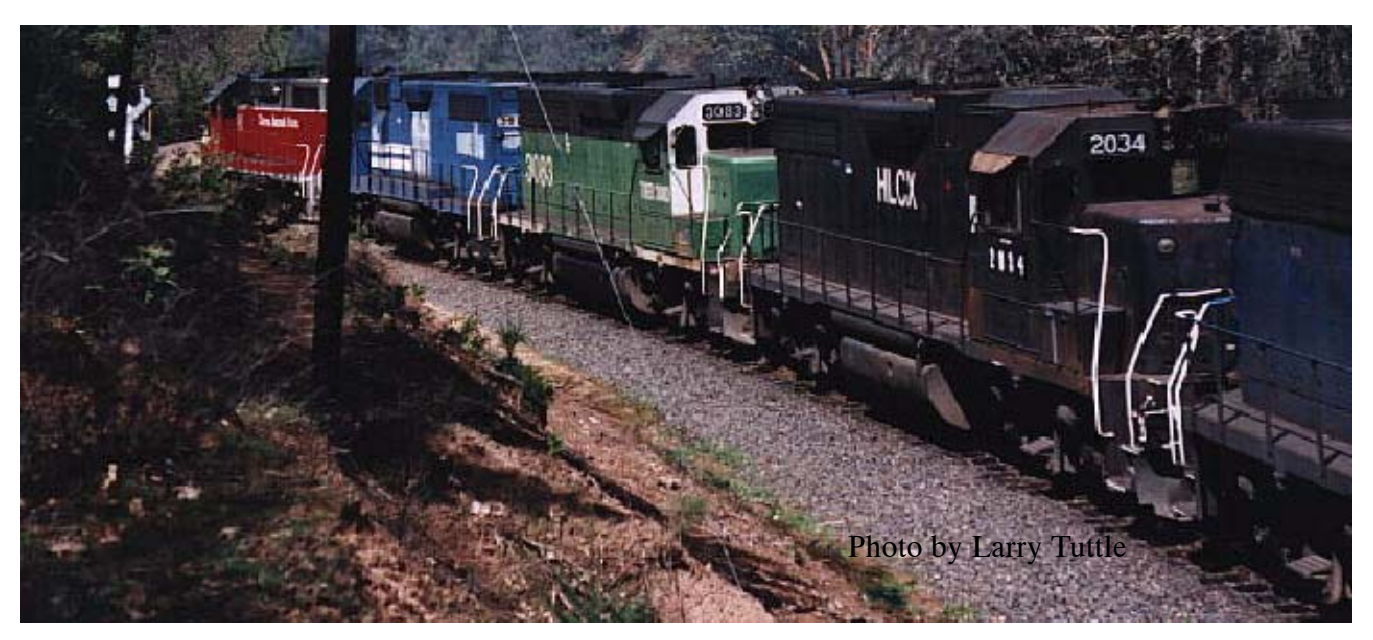
Cresting the top of Merlin Grade near Hugo, this Medford — Glendale Hauler displays quite a diversity of railroad heritage and paint schemes on this April 1995 morning. All units are GP-38s except for the single ex-BN GP-40. Four to six locomotives and 30-car trains or less are typical on this railroad.

nies and provides transportation through interchanges with other line-haul carriers to serve all of North America. Lumber and related products are the mainstay for the CORP.