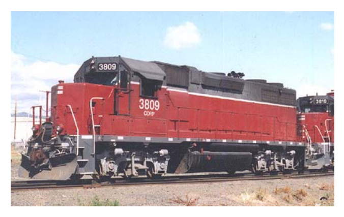
Many of the current locomotives are GP38-3 and painted in CORPcolors.